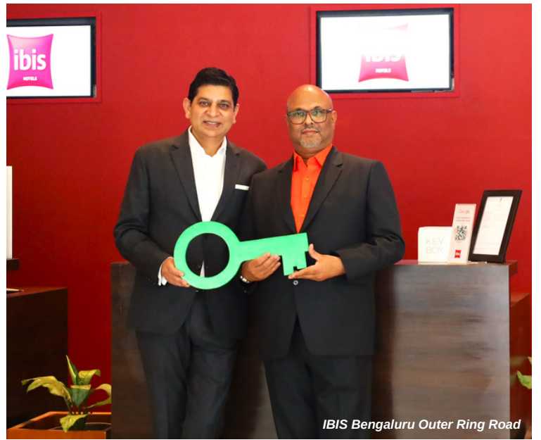
IBIS Bengaluru Outer Ring Road

Both the hotels underwent a lengthy and rigorous process of audit to earn this renowned international certification. The Green Key certification signifies a commitment of the hotels towards the sustainable environment in the hospitality and tourism sector.