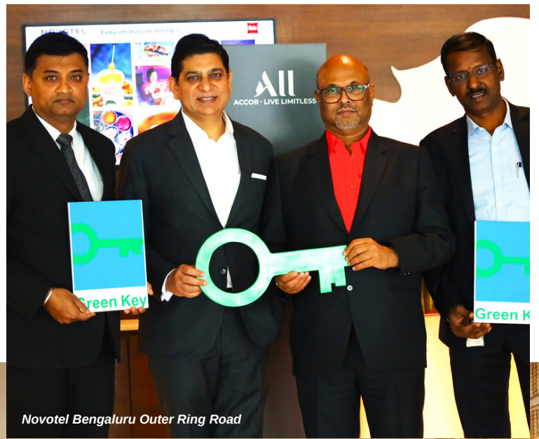
Novotel Bengaluru Outer Ring Road